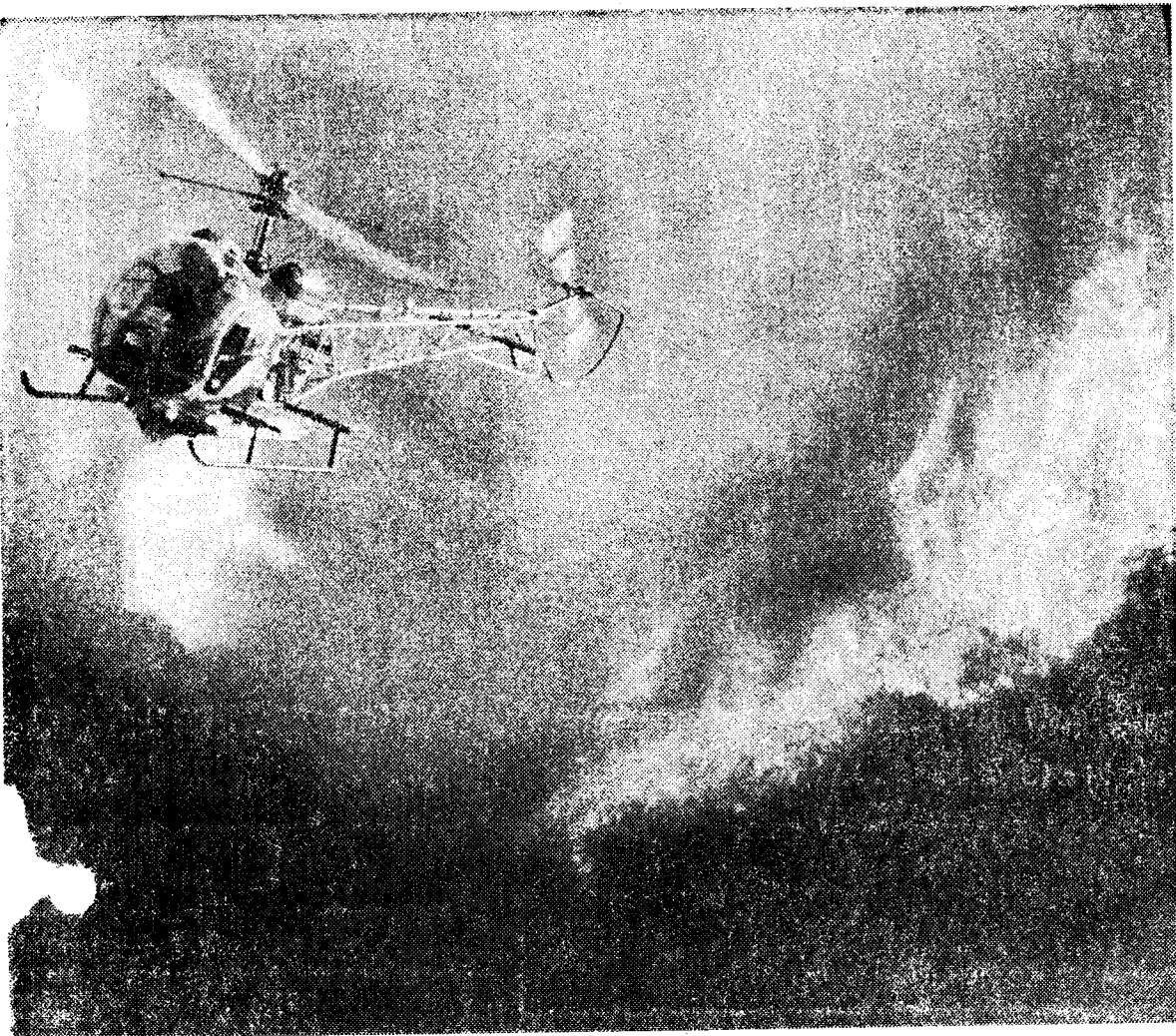
APPLYING THE DAMPER—L.A. County Fire Department helicopter drops water on Flintridge blaze.