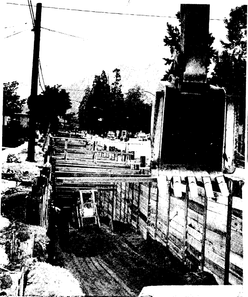
JUST BEGINNING — Norco Construction Co. crews are really moving earth in a 700-foot portion of the Chevy Chase Canyon storm drain project designed by the City of Glendale and being installed un-

der Los Angeles County Flood Control District direction. Initial work will be terminated as soon as the concrete box is installed, and the contractor will not return until after the rainy season.